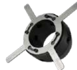
Special tool for elbow beveling